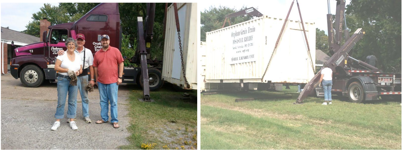
Disaster Response trailers move on to aid disaster response in Joplin, MO